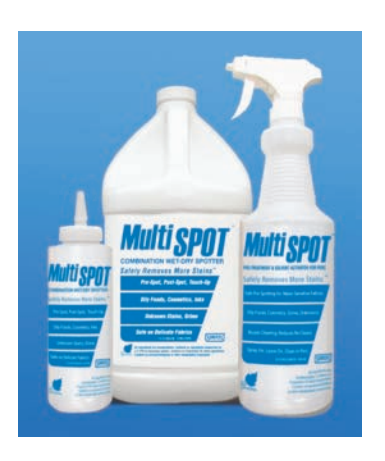
Don't waste time with trial and error spotting. Get MultiSPOT!

MultiSPOT is a unique soil release agent that can be used in many ways. MultiSPOT works as a combination wet-dry spotter for all solvents. When used on the board as a pre-spotter or post-spotter, it effectively removes a number of common stains and flushes easily with water or steam.